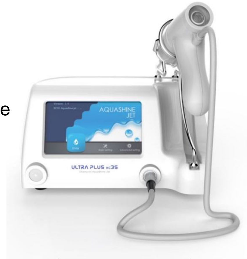
Ultra Plus Aqua Shine XC3S

An innovative needle-free serum administration device that distributes serum through skin (transdermal)