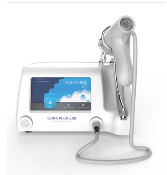
Ultra Plus Aqua Shine XC3S

These studies have shown that needle-free serum delivery can be as effective and produce less pain and anxiety than traditional needle injection